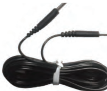
REPLACEMENT OVAL LEAD WIRE