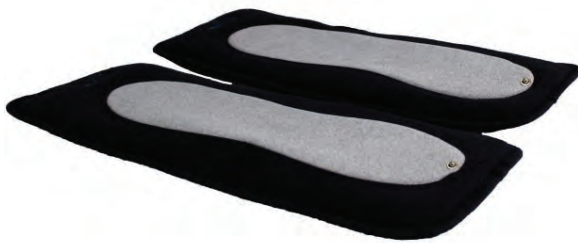
REBUILDER FOOT PADS