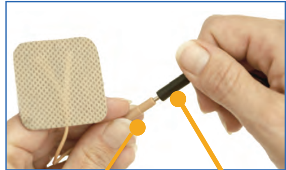
PLASTIC END OF ADHESIVE PAD

Make sure to push the metal probe from the lead wire all the way in.